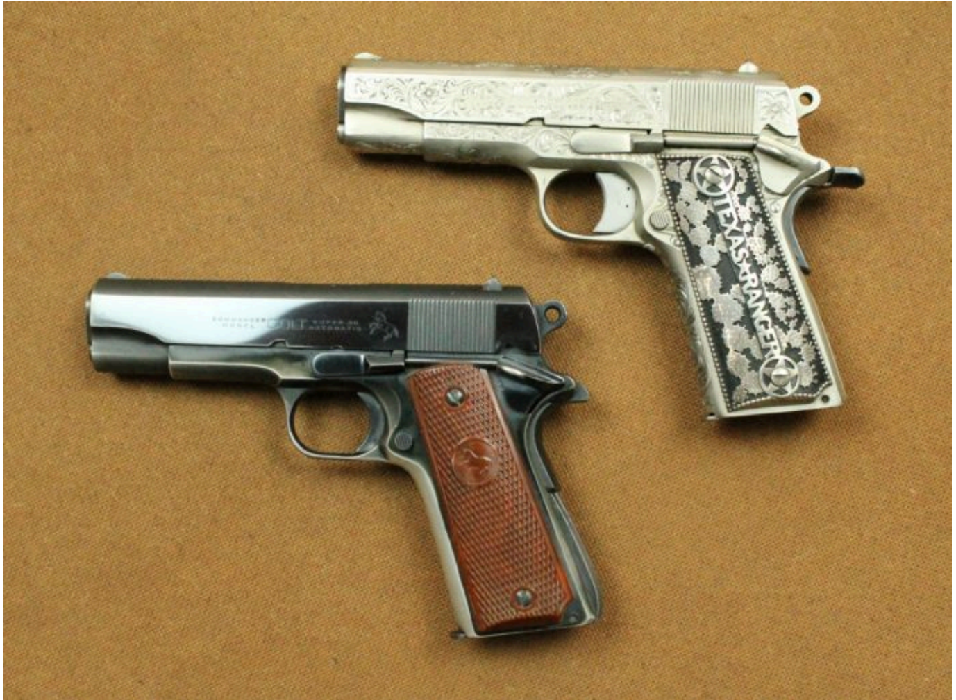
Colt Commander Automatic Pistols